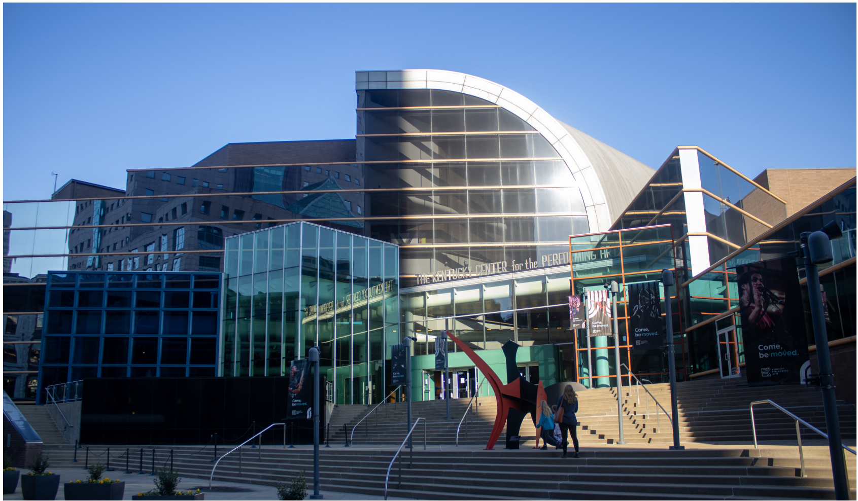
Louisville Ballet performs the The Brown-Forman Nutcracker at the Kentucky Center for the Performing Arts.